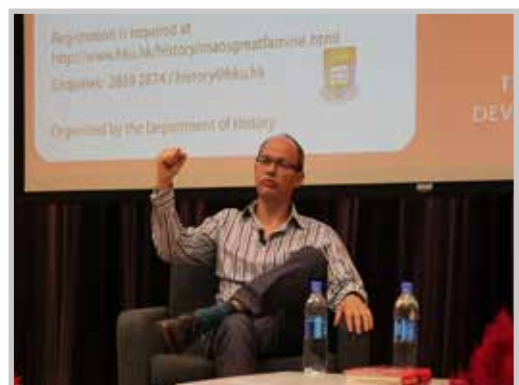
Prof Frank Dikötter speaks at a History in the Making event

Professor Dikötter's book will go some way to unraveling that story by revealing the terrifying but little-known human consequences of Mao's early policies.