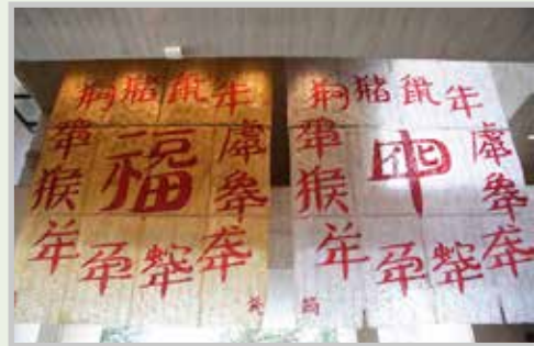
United Nations: We Are Fortunate Animals - an installation commissioned by the Herbert Museum of Art, Cornell University