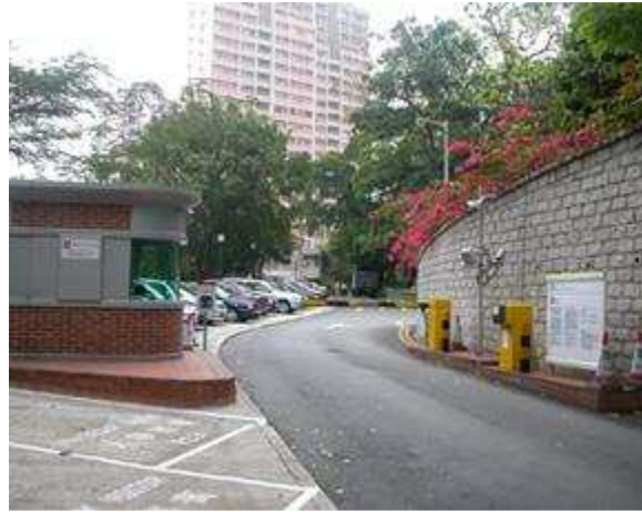
West Gate shroff

It is not easy to find a car parking space on the HKU campus, so it is advisable to take public transport.