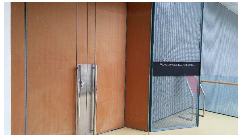
f. Walk up the stairs on your left to reach WGW entrance.