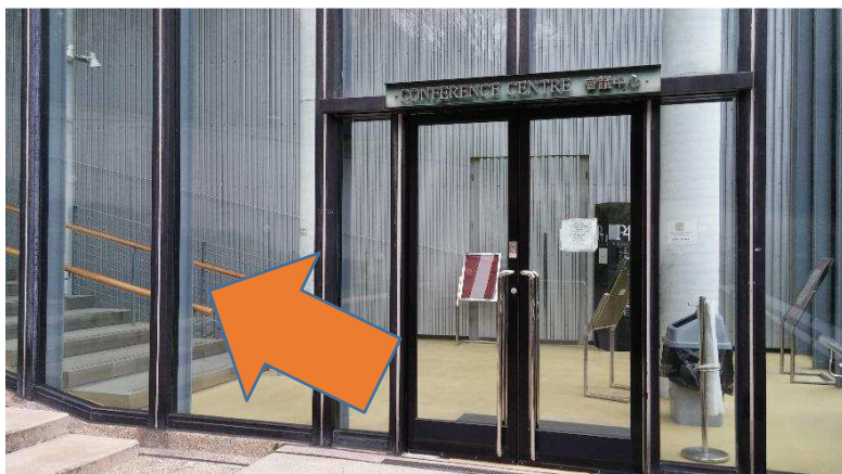
e. Enter the Graduate House from the glass door entrance