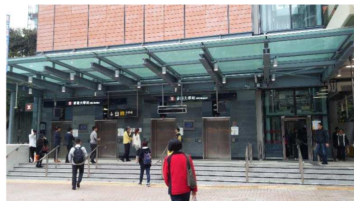
HKU MTR Station lift area (take lift to Exit A2, then follow Route [1])