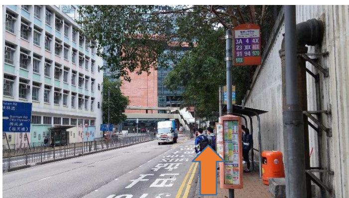
Bus /Minibus stop near to Haking Wong Building